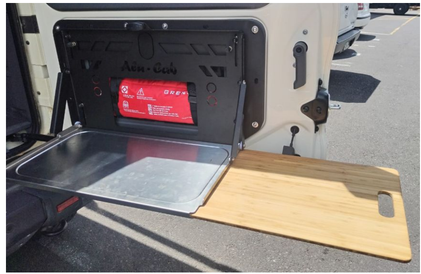
Cutting board extended