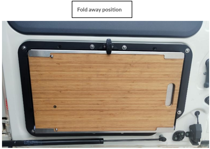
Fold away position